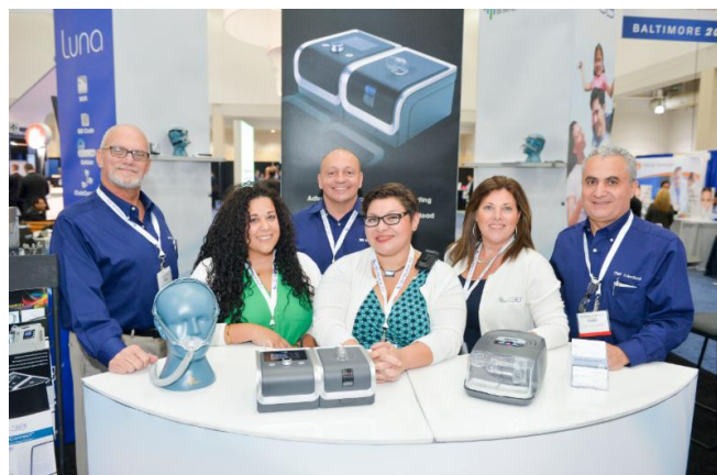
Hynes Convention Center - Boston, MA

Thank you to everyone who made the show a success.