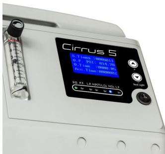
Cirrus 5 Oxygen

3B Medical is offering free online training to any customer for use of iCodeConnect. To schedule a webinar contact Angela Giudice, RPSGT at agiudice@3bproducts.com